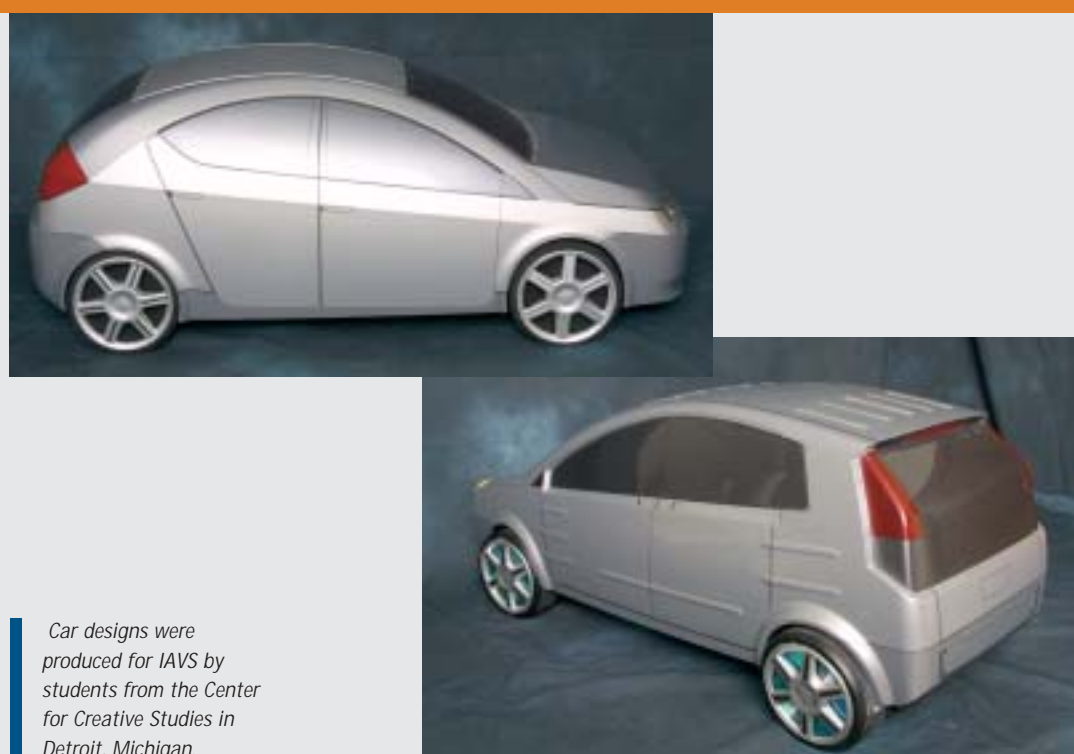
Car designs were produced for IAVS by students from the Center for Creative Studies in Detroit, Michigan.

The new building, which is slated to open by mid 2004, will house laboratories, offices, and other facilities for the IAVS. The institute is currently spread throughout three separate engineering buildings on the University of Michigan-Dearborn campus. The building will contain a variety of teaching and research labs as well as open bay space to conduct projects.